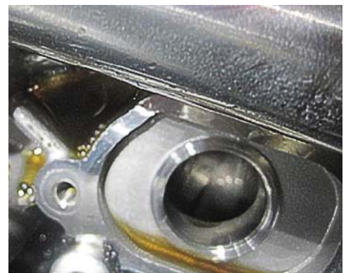
Fault type 1: Hydraulic valve for valve lift switchover leaking.