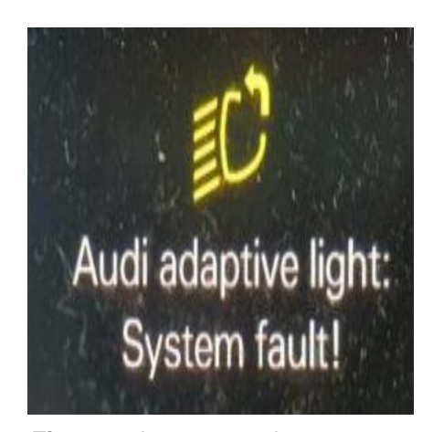
Figure 1. Instrument cluster message.

The message "Audi adaptive light: system fault!" is displayed in the instrument cluster (Figure 1).