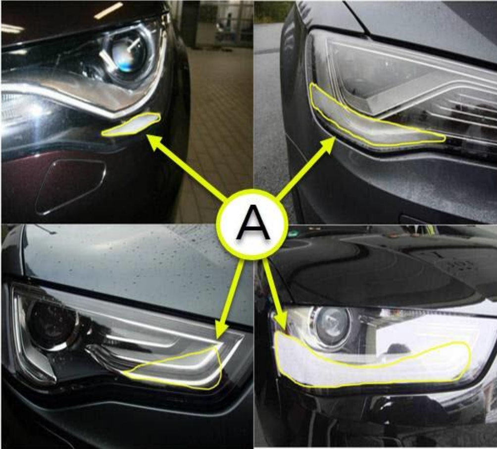
Figure 1. Condensation on the inside of the lights.