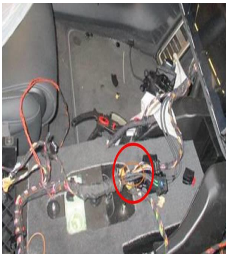
Figure 1. Location to inspect underneath center console.