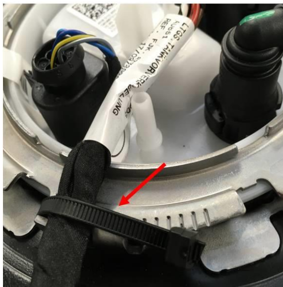
Figure 5. Harness shown secured to tank.