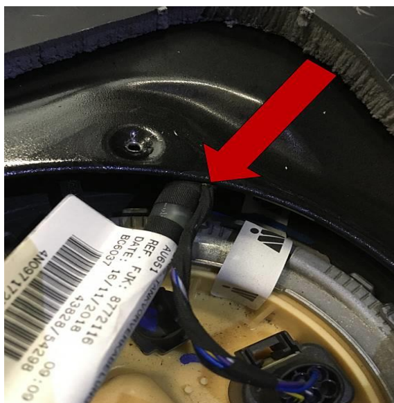
Figure 1. Location to inspect for rub through.

The wiring of the fuel tank senders can rub through on the service opening for the fuel tank.