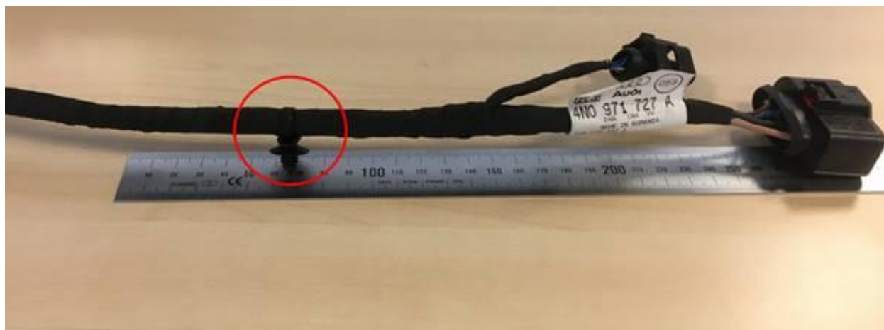
Figure 3. Clip to be removed from the old or new harness.

3. Lever out the round clip between the vehicle body and fuel tank highlighted by the red circle in Figure 3.