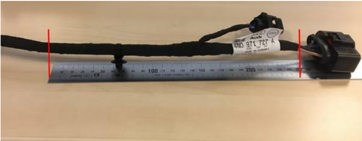
Figure 4. Add additional wrapping between the two red lines, approximately 250mm.