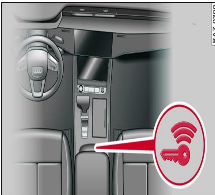
Figure 3. Center console in Q8 with a mark for the vehicle key.