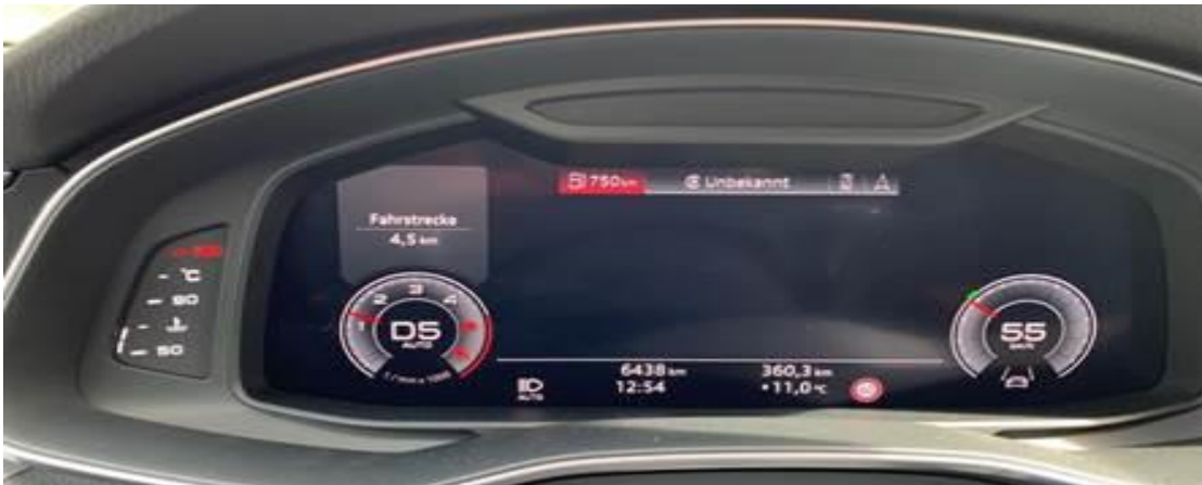
Figure 1. Central display area in the Audi virtual cockpit is black.