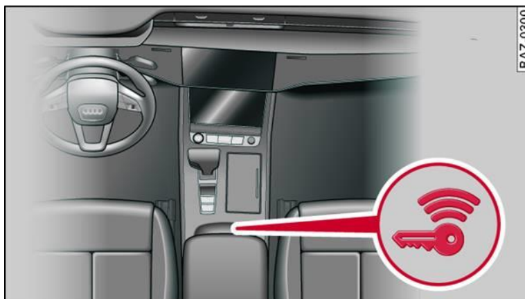
Figure 5. Center console in A8 with a mark for the vehicle key.