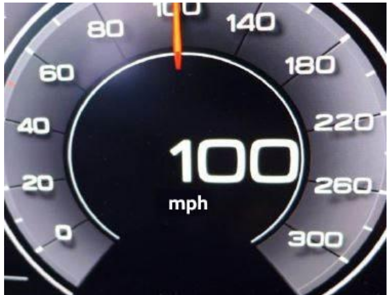
Figure 1. Off-center speed display in the Audi virtual cockpit.