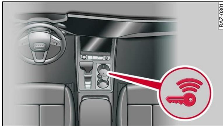
Figure 3. Center console in Q8 with a mark for the vehicle key.