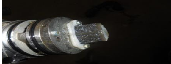
Figure 1. The strainer of pump for the four-wheel drive clutch.