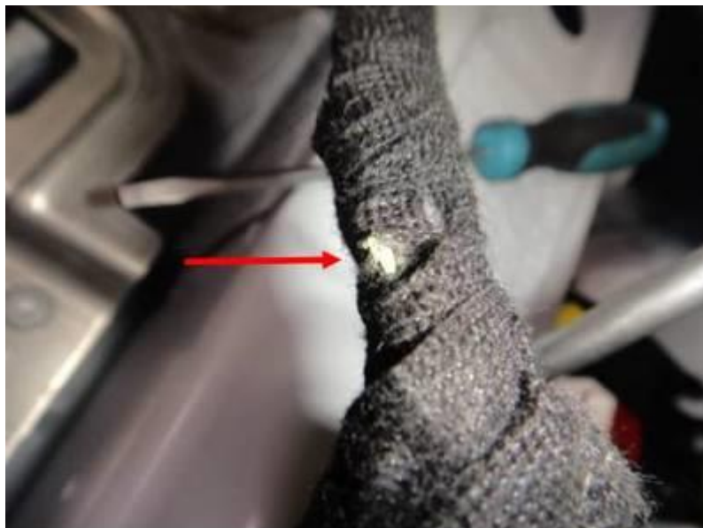
Figure 6. Shows the rub mark on the wiring harness.

Transmission harness replacement and routing instructions: