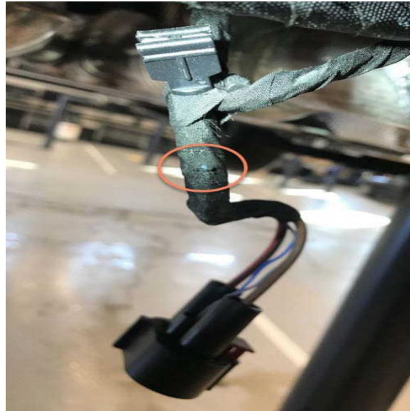
Figure 3. The damage on the original harness might be difficult to spot.