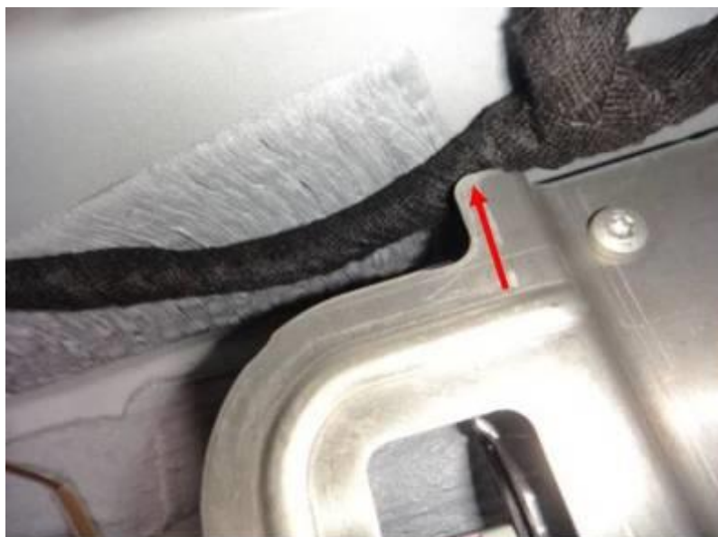
Figure 5. The area where the body harness may rub.

Tip: The J1121 is located under the driver's seat. For this reason, thoroughly inspect the harness as described in step 1 first.