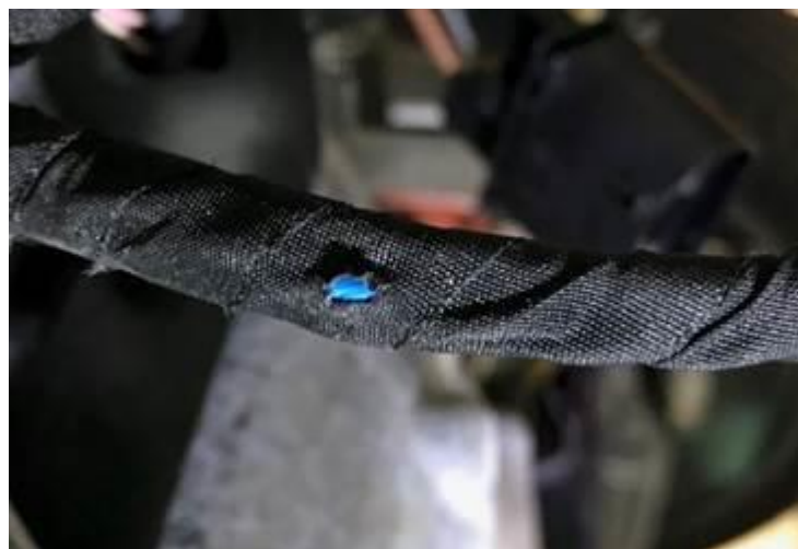
Figure 2. Example of a small rip in the protective tape.