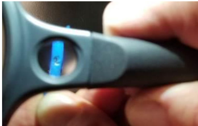
Figure 4. The cause of the DTC may be as small as a pinhole.