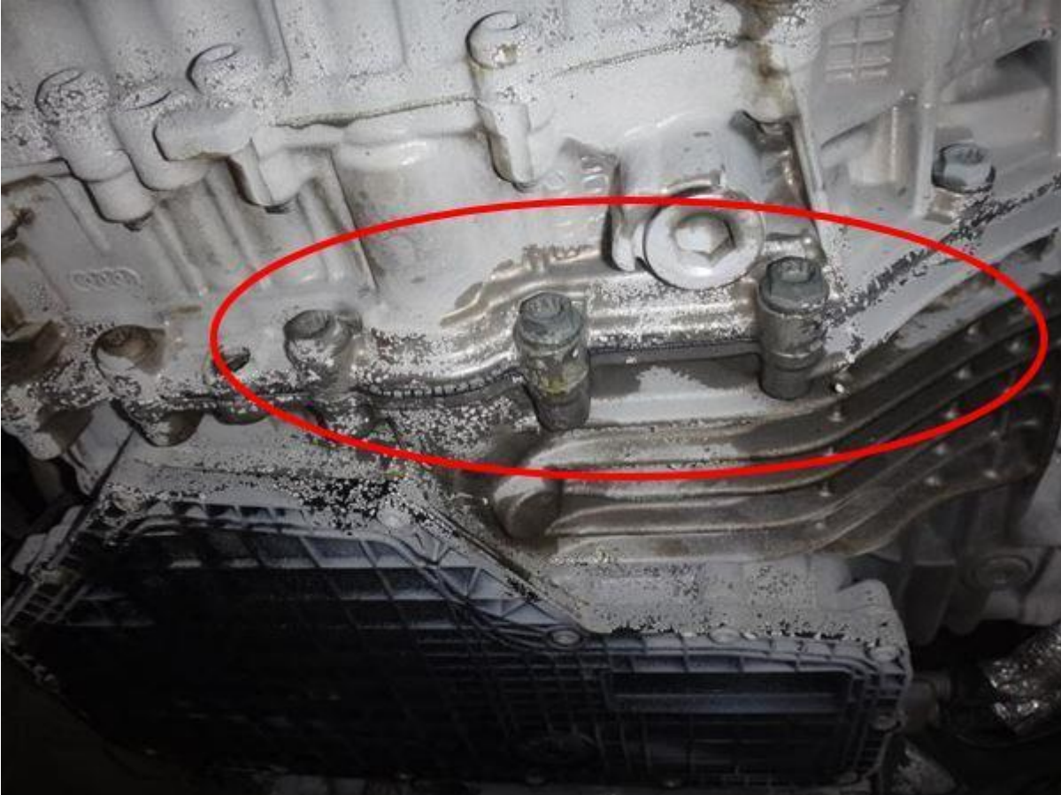
Figure 2. Oil leak example.