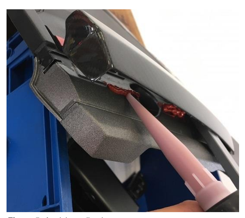
Figure 5. Applying adhesive.

3. Apply the adhesive generously on the middle edge of the two surfaces below the trim panel (Figure 5 – 6).