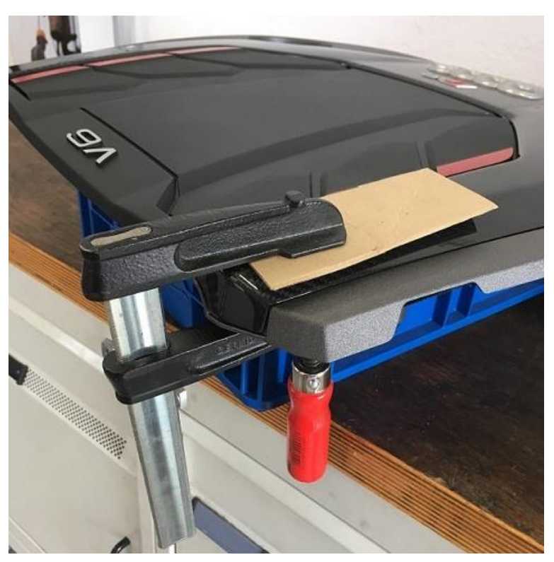
Figure 7. Put the cover in position and clamp together.

4. Put the trim panel and the engine compartment cover in position with a screw clamp and let the adhesive harden for 4 hours (Figure 7).