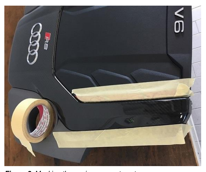
Figure 3. Masking the engine compartment.

Mask the engine compartment cover in the area of the trim panel (Figure 3).