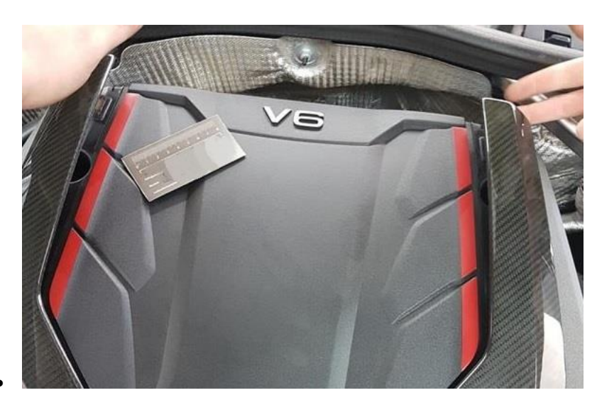
Figure 1. Engine compartment cover.

Rattling noises from engine compartment and the trim panel comes off engine compartment cover (Figure 1).