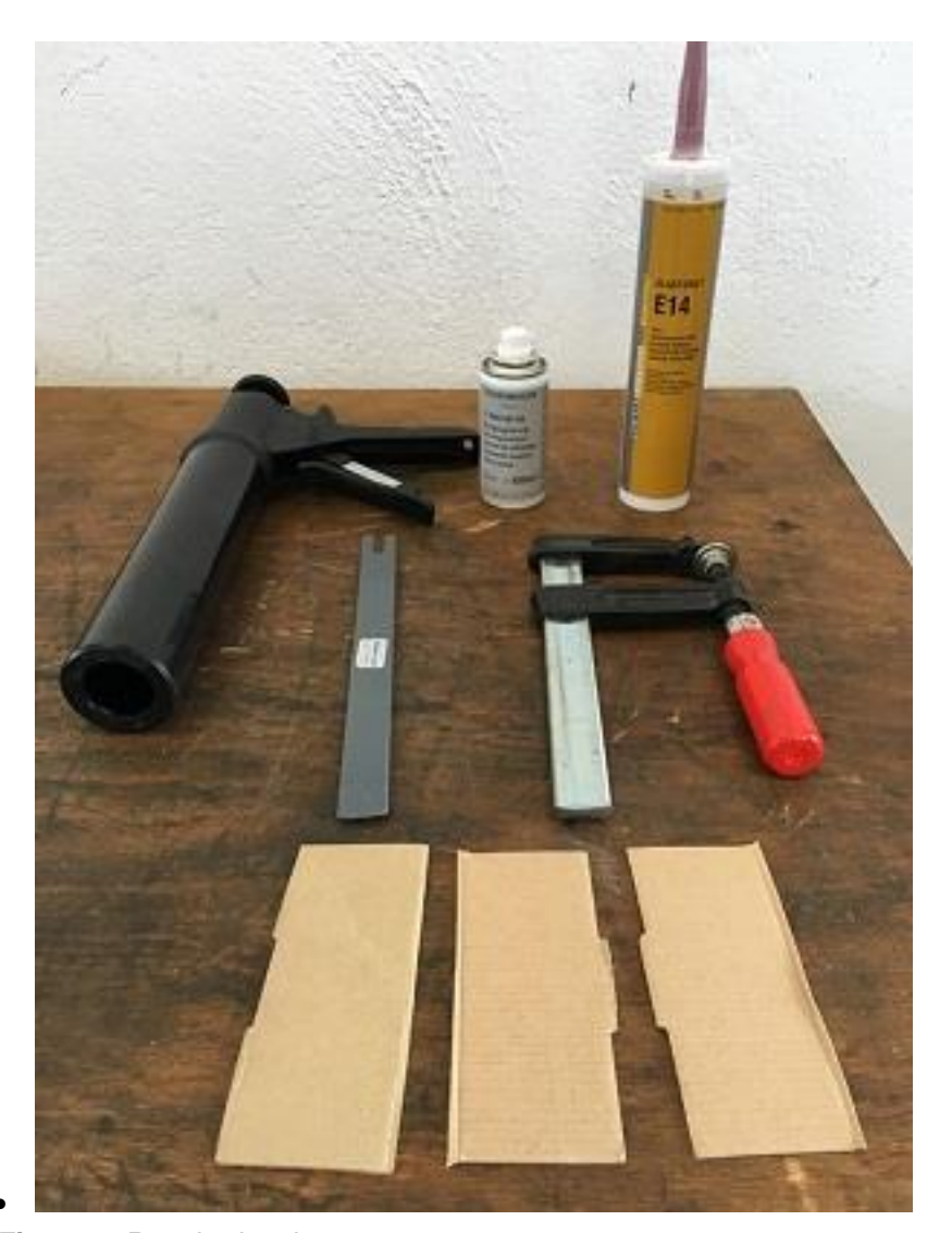
Figure 2. Required tools.