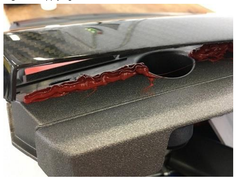
Figure 6. Applying adhesive.