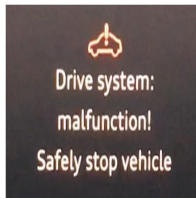
Figure 1. Message appears with DTC P0A0F00.

The condition applies to this PSS only when the specific DTCs are present. If other DTCs are also present, conduct regular diagnosis outside of this PSS.