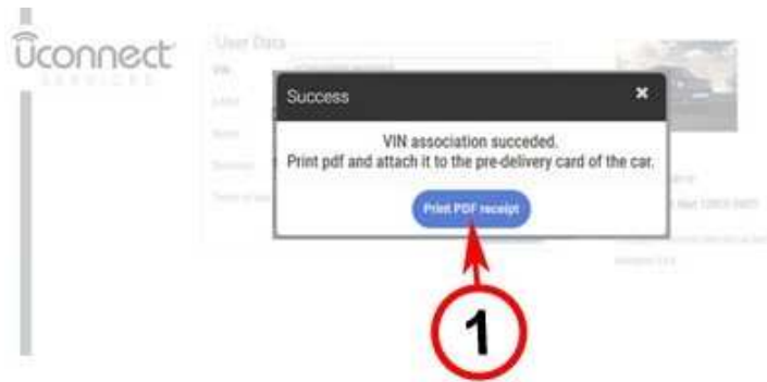
Fig. 6 Confirmation Pop-up