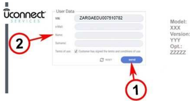
Fig. 5 Activation Pop-up