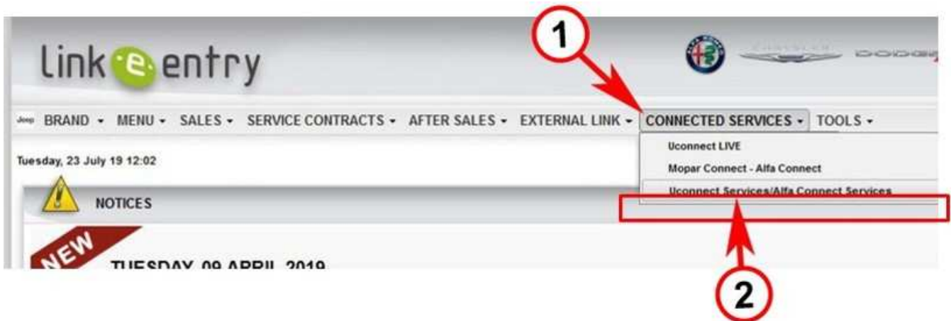
Fig. 3 Link.e.entry Pop-up