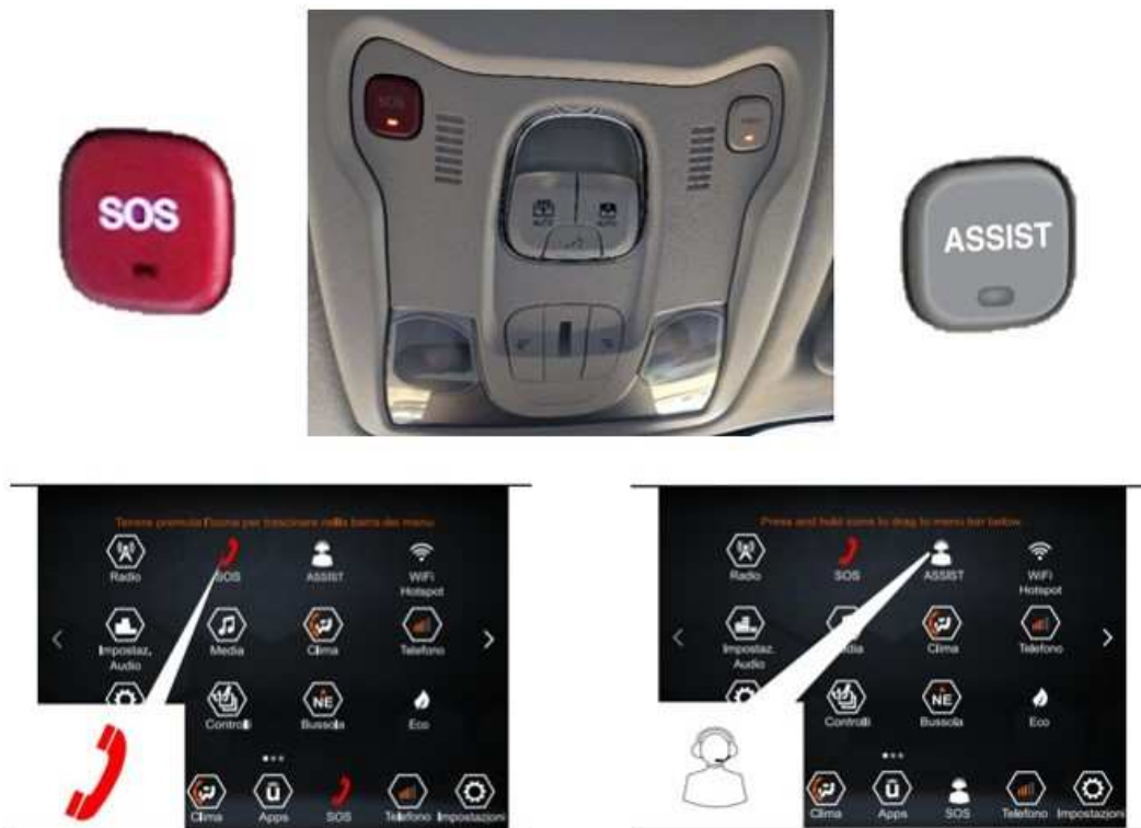
Fig. 1 SOS or ASSIST Button Locations

NOTE: According to the models/versions, the call can be made manually by pressing a button or by selecting a specific icon on the radio display (Fig. 1) .