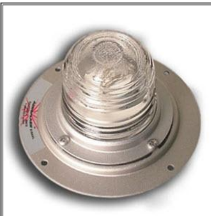
Figure #3: 2230289C91