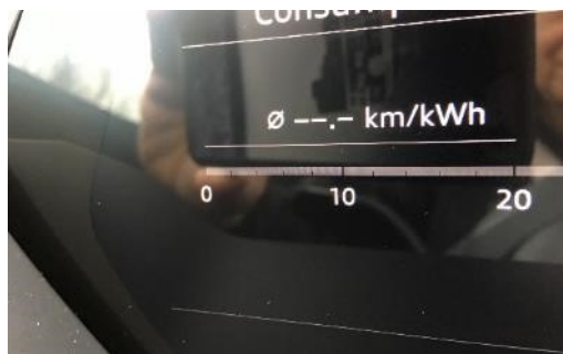
Figure 1. Wrong units after a factory reset.