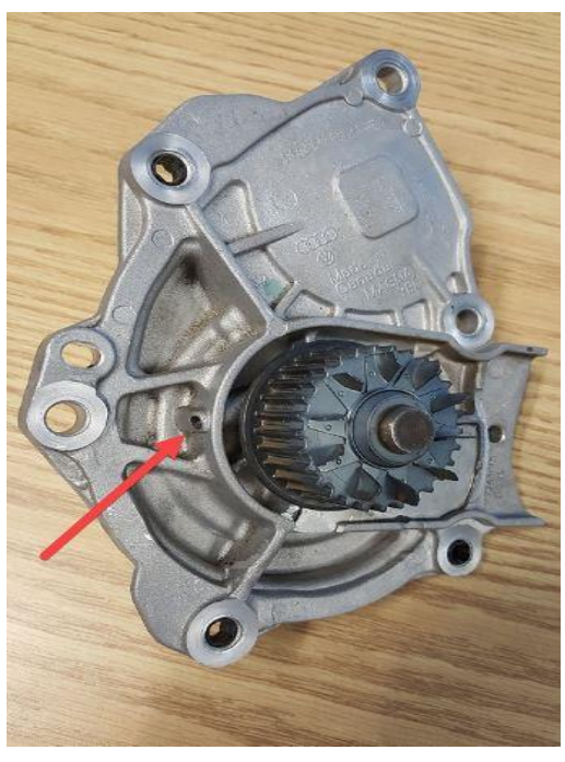
Figure 1. Control/weep hole leak.

The water pump should only be replaced if there is a leak from the control/weep hole (Figure 1). All other replacements are unauthorized i.e. combination replacement with the thermostat housing.