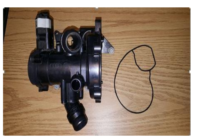
Figure 3. Thermostat housing replacement required parts.