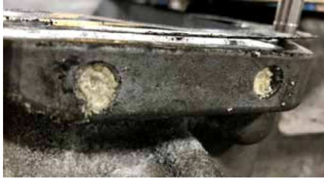
Clogged vent ports