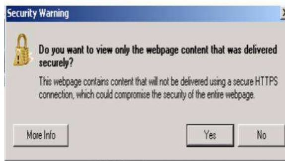
Fig. 1 Security Warning Pop-up

NOTE: The software acquisition requires the deletion of all the files on the USB flash drive before copying the contents of the folder necessary for the update. Copy only the files contained in the folder onto the flash drives, NOT the folder itself.