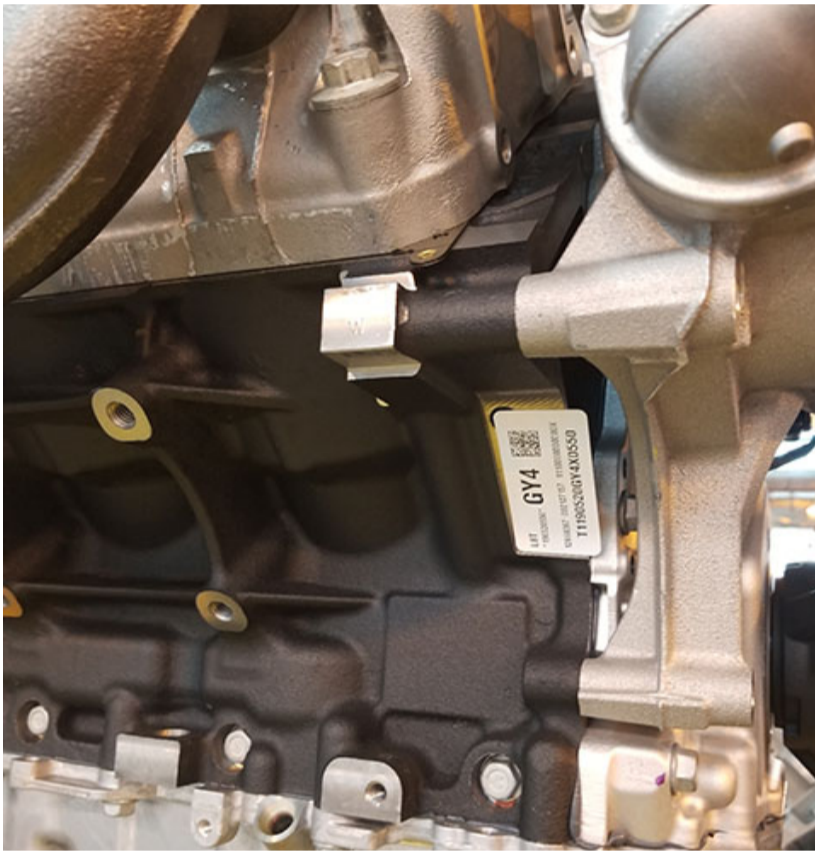
1) Near front of engine, on right hand side of the block