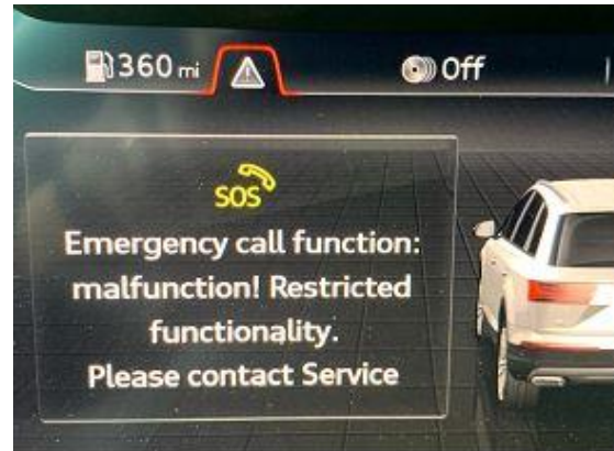
Figure 2. SOS warning in the instrument cluster.