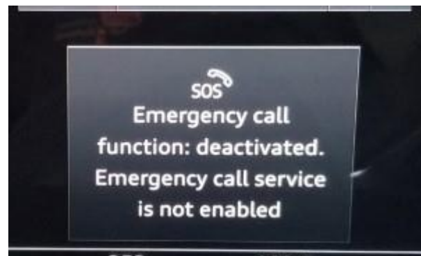
Figure 1. SOS warning in the instrument cluster.