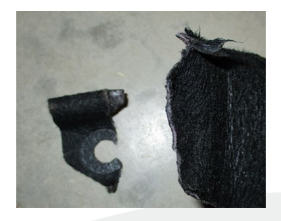
Figure 4 – Panel Tearing at Fasteners; Replace Panels

Water-induced damage is evident from panel tearing at fastener locations (Figure 4), panel folding at leading edges (Figure 5), or panel separation at leading edges (Figure 6), all without evidence of object-contact.