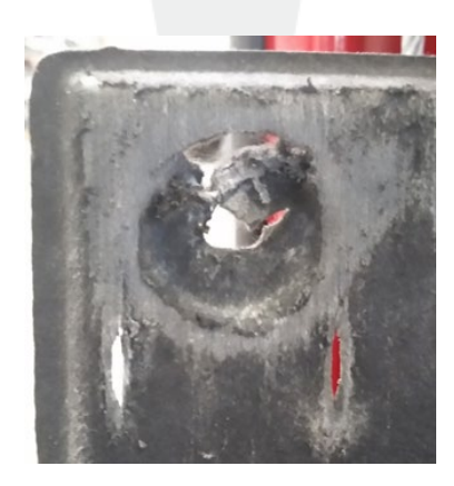
Figure 7 - Object-contact; Not Covered

NOTE: If object-contact damage is adjacent or integral to what might be water-induced damage, for example, severe abrasion next to a torn panel at a fastener (Figure 7), consider the damage is from object-contact, and is not covered by this bulletin.