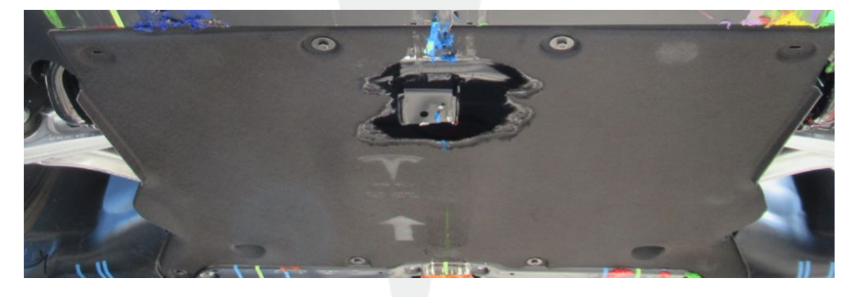
Figure 3 - Wear Through; Not Covered