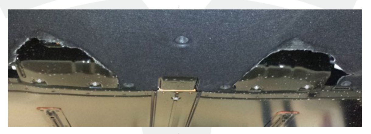
Figure 6 - Panel Separation At Leading Edge; Replace Panels

NOTE: If object-contact damage is adjacent or integral to what might be water-induced damage, for example, severe abrasion next to a torn panel at a fastener (Figure 7), consider the damage is from object-contact, and is not covered by this bulletin.