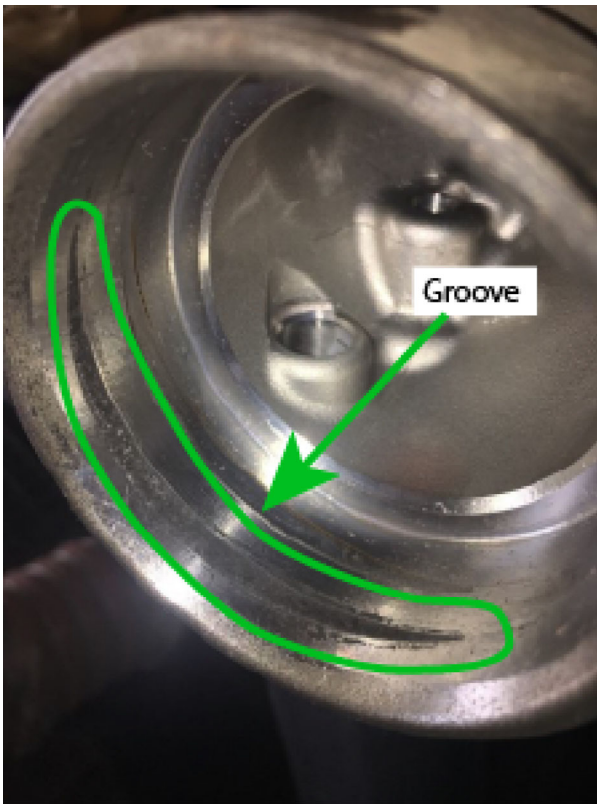
Figure 3 Improved coolant pipe installation