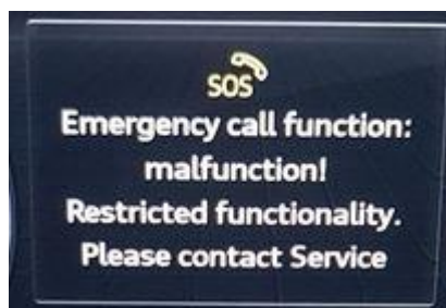
Figure 1. Emergency call malfunction warning.