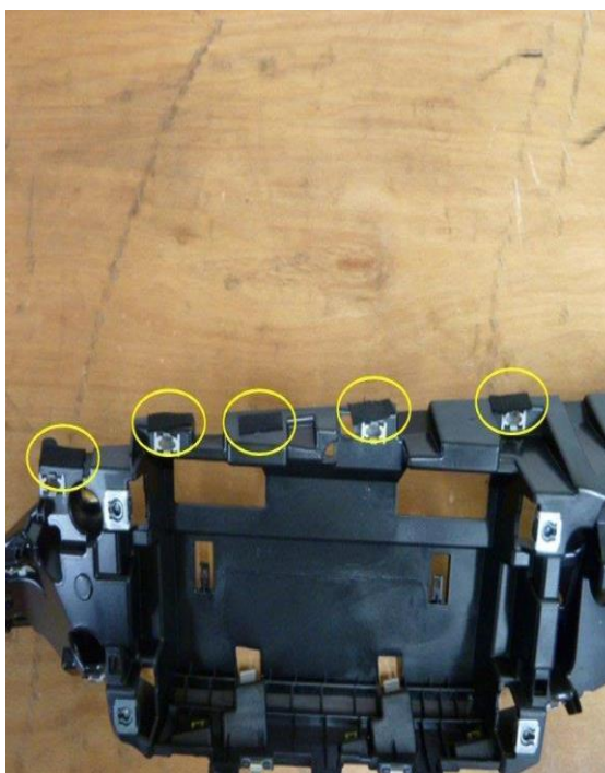
Figure 3. Apply felt strips to the circled areas.