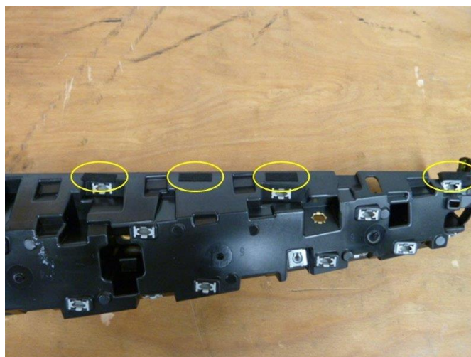
Figure 4. Apply felt strips to the circled areas.