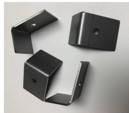
Recommended clip locations