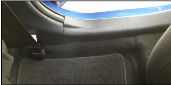
Figure 1. Good Condition