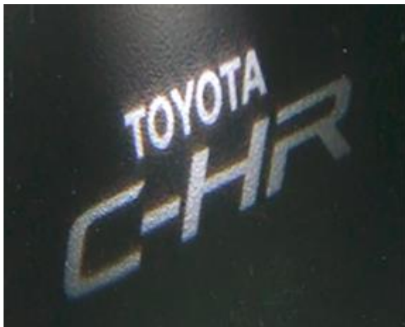
Figure 1. OK Condition