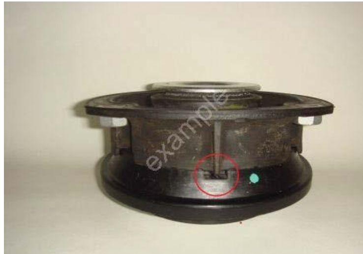
Figure 2. The correct installation position of suspension strut mounting and axial deep-groove ball bearing.