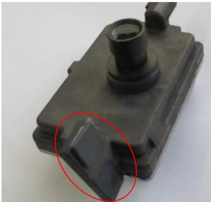
Figure 2. Incorrect attachment of spacer.

Be careful to prevent damage to the front camera for assistance systems -R242- when removing the adhesive residue.