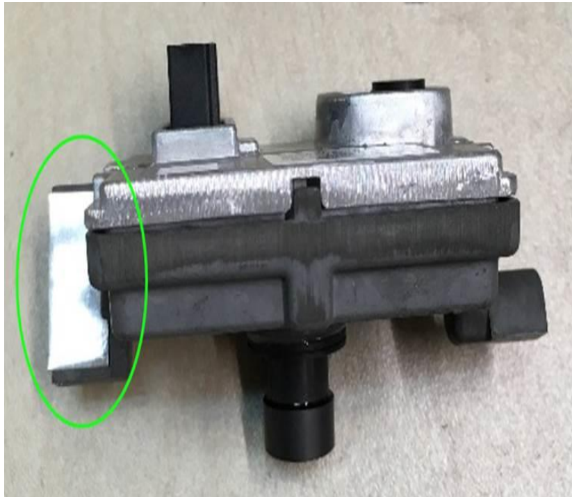
Figure 1. How to correctly attach the aluminum adhesive foil on the front camera for assistance systems -R242-.