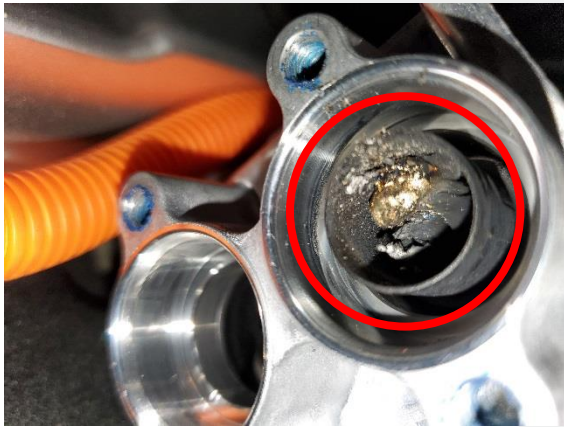
✘ Figure 1 (Example of damage to the FDU HV connector terminal)