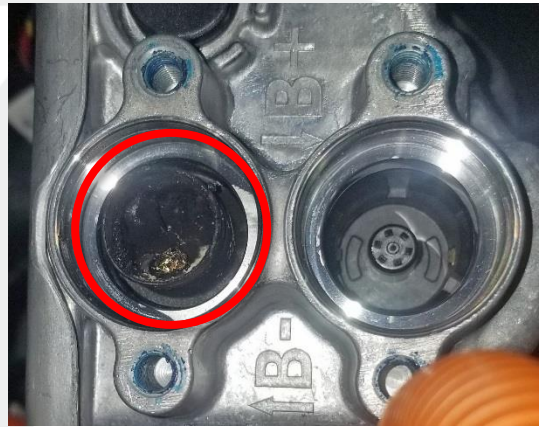
✘ Figure 2 (Example of damage to the FDU HV connector terminal)