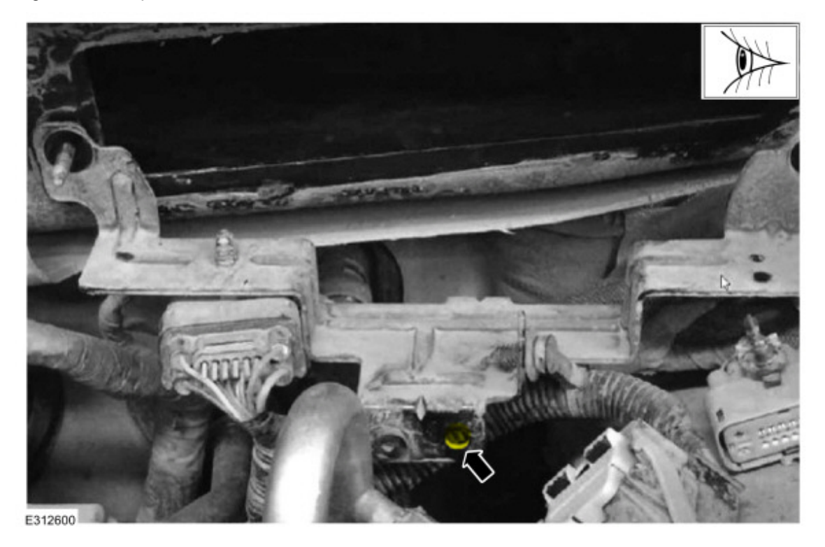
Figure 2 - Pushpin location on the PCM bracket