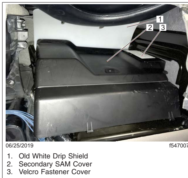
Fig. 1, With Old Drip Shields Installed