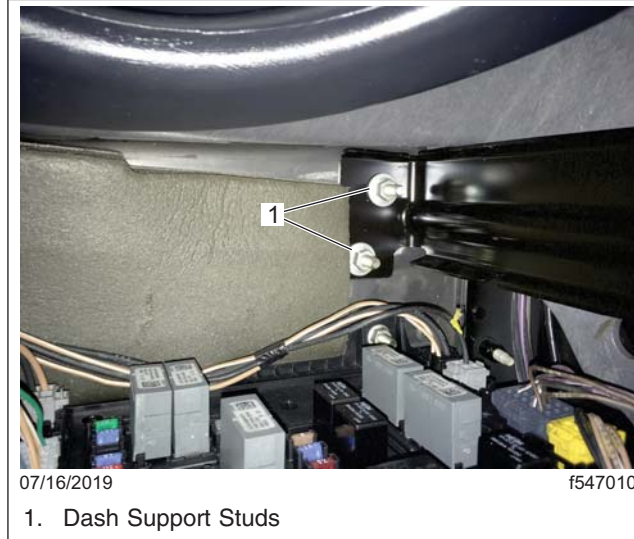
Fig. 2, Dash Support Studs

Business Class M2 > Cascadia 108SD/114SD New Cascadia