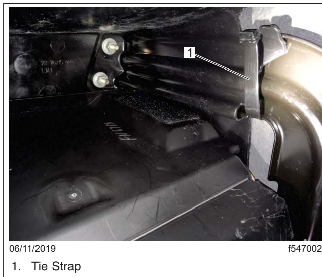
Fig. 4, Tie Strap Attached