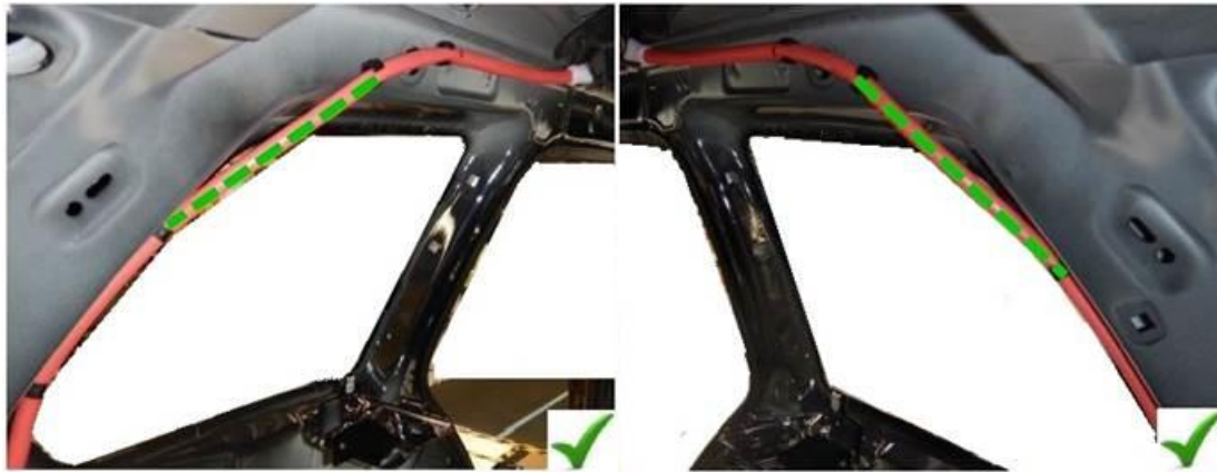
Figures 4 and 5: Correct routing of left and right rear drain hoses with no slack between the 2 nd and 3 rd mounting clips.

The new hoses (longer than original) should be cut to match the length of the original hoses prior to the installation. During installation of the new drain hoses, ensure the hoses are pulled taut between the 2 nd and 3 rd mounting clips with no excess slack in the hoses (See Figures 4 and 5).