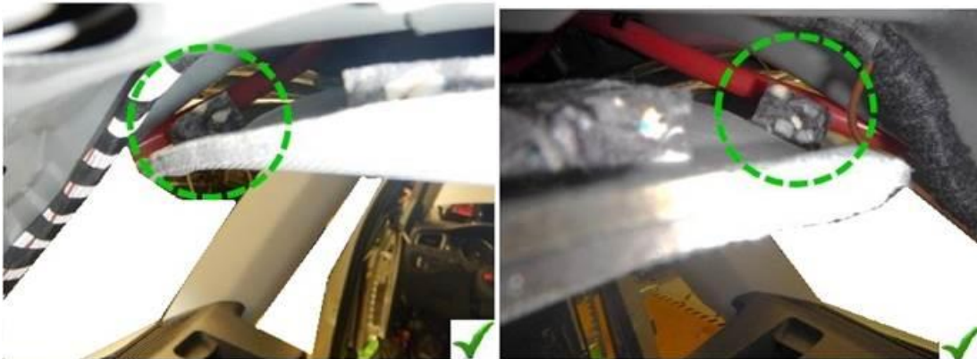
Figures 6 and 7, Rear drain hoses routed behind foam blocks on headliner.