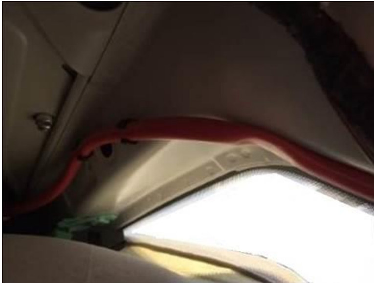
Figure 3: Impression on rear sunroof drain from contact with headliner foam block.

Care must be taken when working with the headliner. The headliner bends easily. Damage to the headliner during this repair is not covered by warranty. Replace the headliner if it is bent.