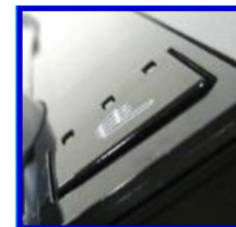
Switch in normal “flush” position