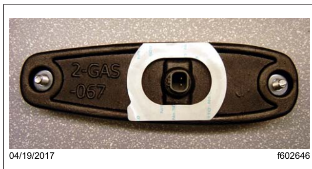
Fig. 1, Marker Light with Peel-and-Stick Adhesive Gasket

NOTE: The roof marker lights may collect moisture between certain portions of the lens and the gasket. This is completely normal and does not constitute a warrantable failure. Only the part of the lens which contains the electronics, in the center of the marker light, is sealed from the elements. See Fig. 2 .