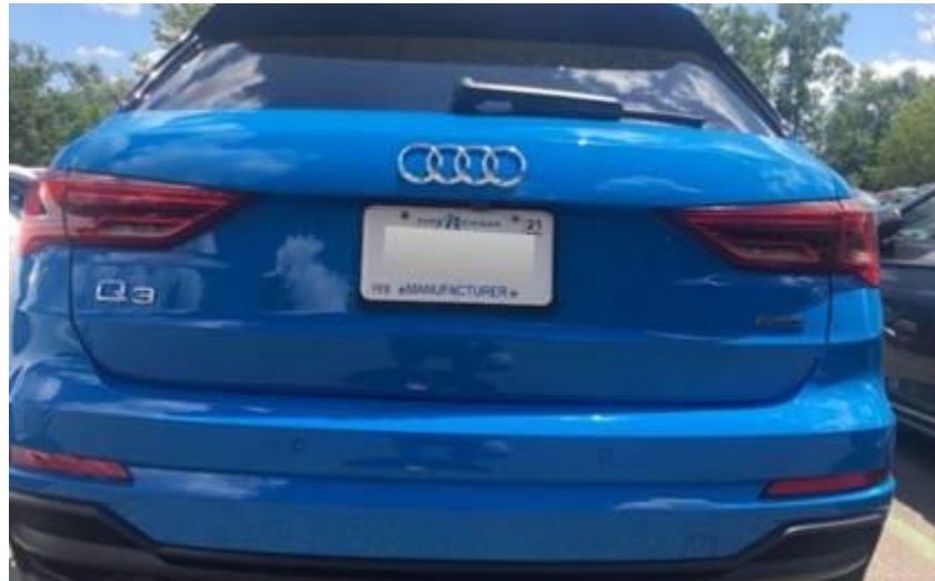
Figure 2. The rear license plate successfully installed on the new Q3.