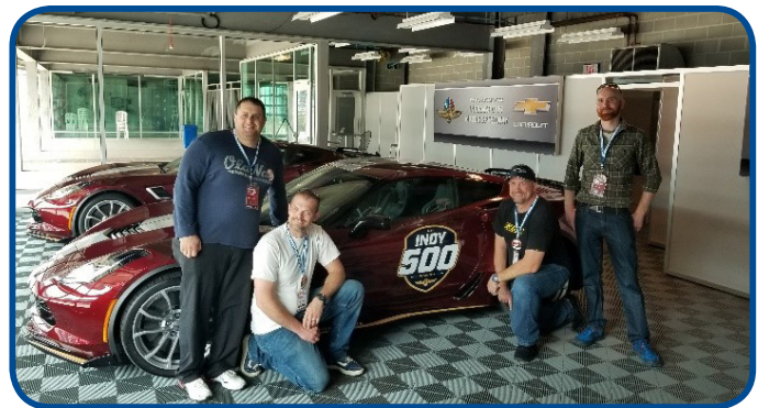
Left picture: IMS guided museum tour. Right Picture: Pace car for the Indy 500.