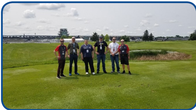
Left picture: Out on the IMS golf course on a nice sunny day!

Next, the group was whisked off on a private golf cart tour of the 2.5 mile oval and the 2.49 mile Grand Prix tracks. The tour had various stops along the way which included the Brickyard Crossing golf course of which 4 of the 18 holes reside inside the track, Gasoline Alley, the Winner's Circle, the media & time keeping control rooms within the Pagoda, and concluded with the Technicians lining up on the Yard of Bricks for a keepsake "kiss the bricks" photo shoot.