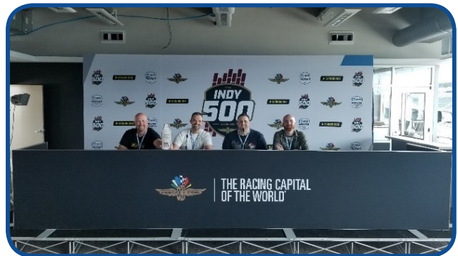
Right Picture: The four winners seeing what it is like to be a commentator for the Indy 500 event.