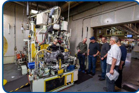
Left picture: Inside SIA at Trim process. Right Picture: Engine testing at the dyno inside SIA.

The group was able to get a bird's eye view of the assembly process for the various trim pieces for our vehicles. Everyone was also able to attend a hands-on review of the engine dyno testing. The Technicians were given a complete walkthrough of the vehicle assembly and the quality control that goes into the entire process. SIA also gave them a great deal of information about the history of the plant from how the line previously operated to what it has become today to meet the ever-increasing expectations of our customers.