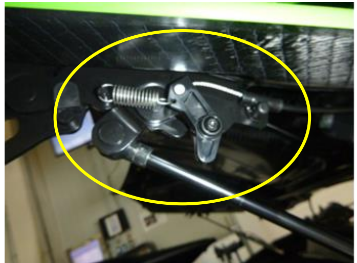
The above picture is only for explicative purposes.

Follow the instructions below to replace the soft top capote hinges.