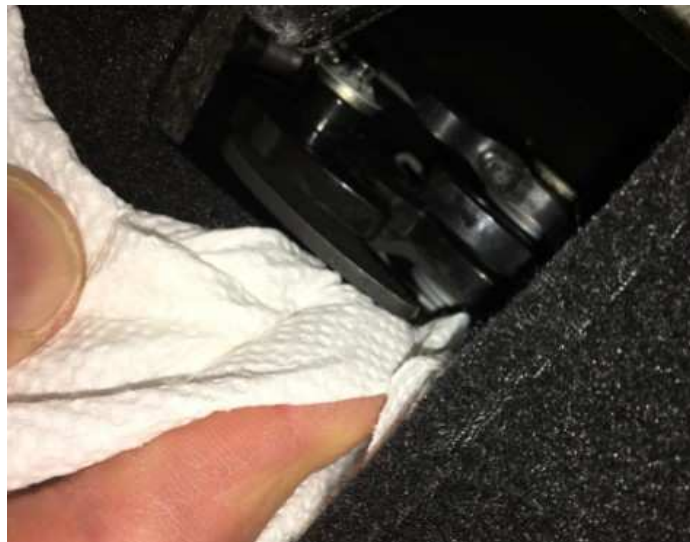
Fig. 2 Wiping Lubricant On Plastic