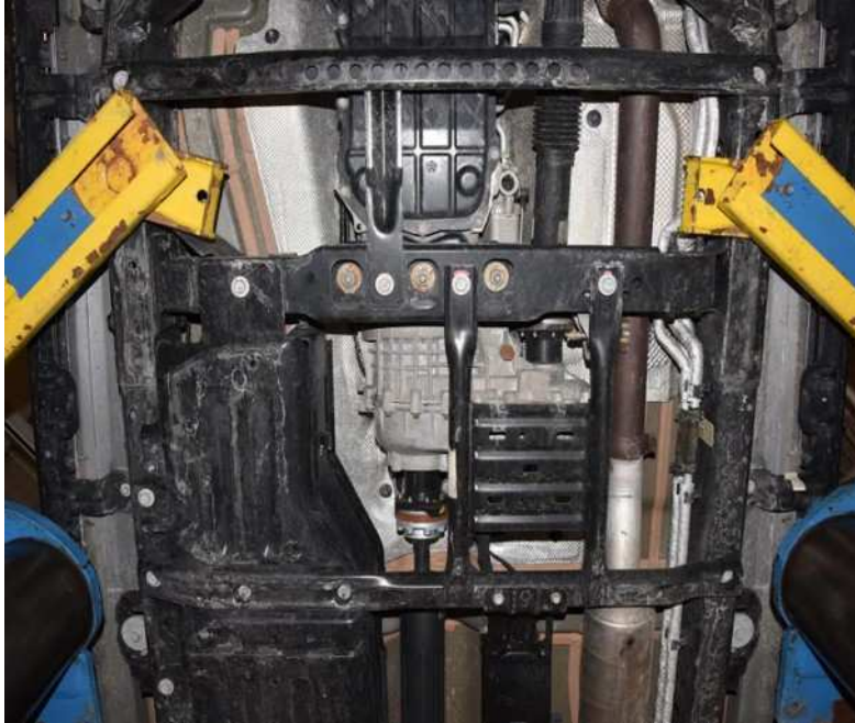
Fig. 1 Cross Member

NOTE: Discard the old trans mount to cross member nuts and isolator bolts, install new ones. do not reuse.