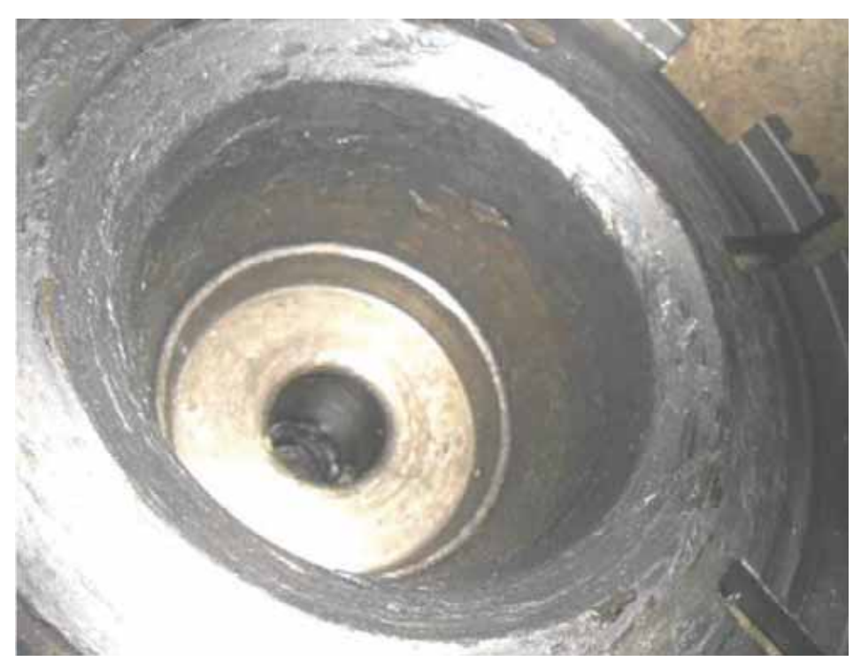
Spalled Bearing Race (Image 6)

These images (5 & 6) represent a failure that went ignored for some time.