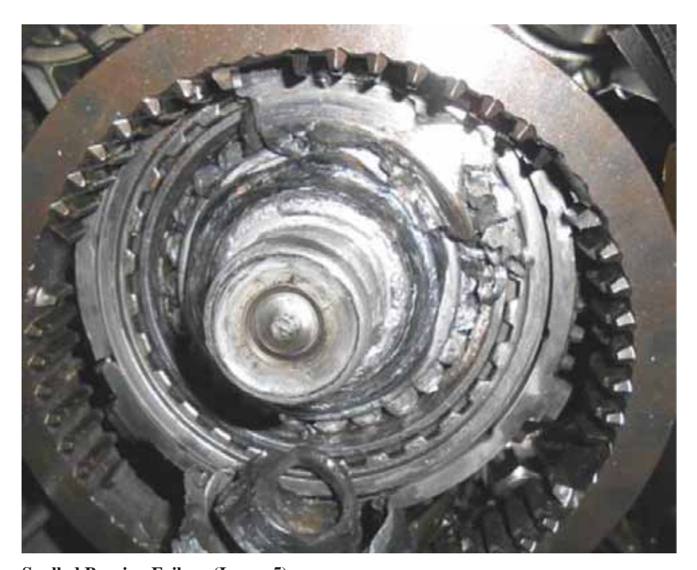
Spalled Bearing Failure (Image 5)

Reviewing DTC readout can be helpful in determining spalled vs. towing damaged spigot bearing. Main shaft speed codes prior to any towing event can indicate that the loss of main shaft pre-load may have begun before the truck was towed to the shop. This means that the bearing started to spall before the unit was towed improperly.