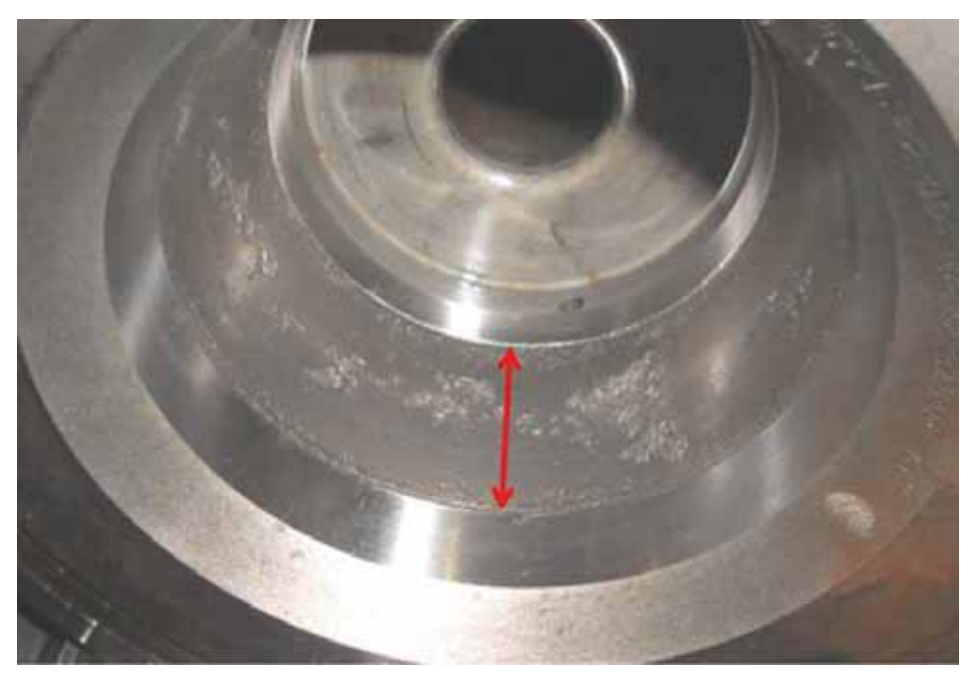
Spalled bearing race (Image 4)