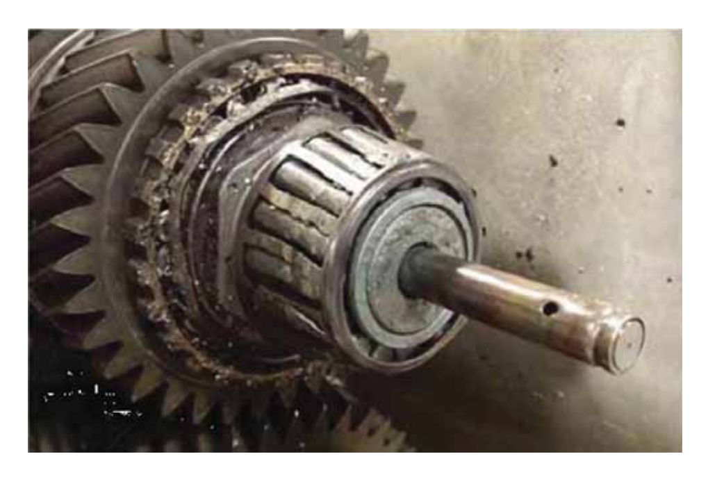
Towing Related Failure (Image 1)