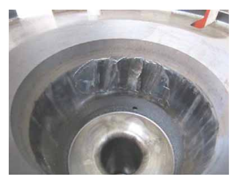
Towing Related Failure (Image 2)