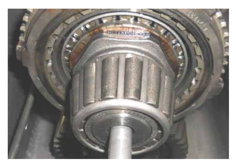
Spalled bearing failure (Image 3)