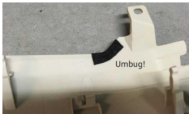
Figure 4. Apply the felt tape around the edge of the trim as shown.