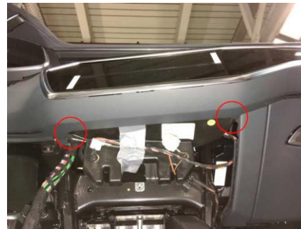
Figure 2. Dashboard trim felt location.