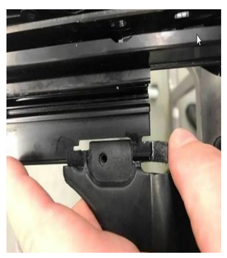
Figure 6. Applying felt tape.

5. Push down on the roller shade pan and starting from the bottom of the guide rail, apply the 1mm thick felt tape and fold them forward and over to the top of the guide rail (Figure 6 and 7).