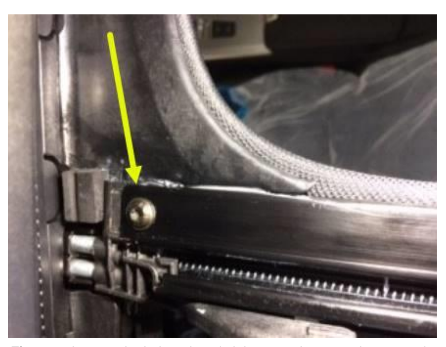
Figure 8. Loosen the bolt and apply lube paste between these panels and under the bolt head. Reinstall the bolt and torque to 5Nm.

7. On the front of the sunroof guide rail, loosen that bolt by 3mm. Lift the guide rail, closing the gap between the rail and the plastic head section. Apply lube paste G 060 567 A2 between the two panels and also under the head of the bolt on the guide rail. Be careful to not get the lube paste on the threads of the bolt. Reinstall the bolt and tighten to 5Nm. (Figure 8).