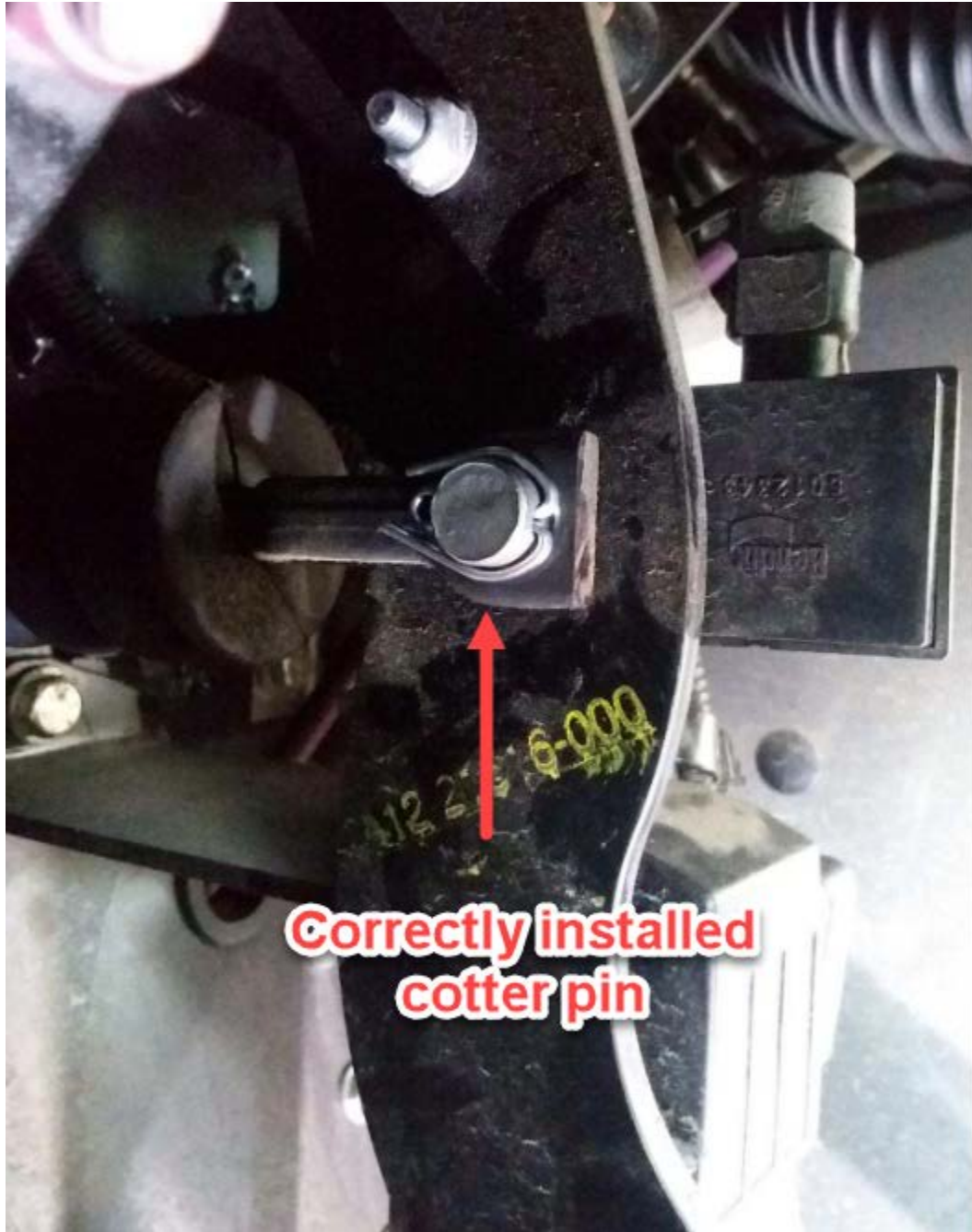
Correctly installed cotter pin