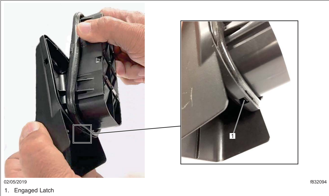
Fig. 2, Engaging the Bottom Latch