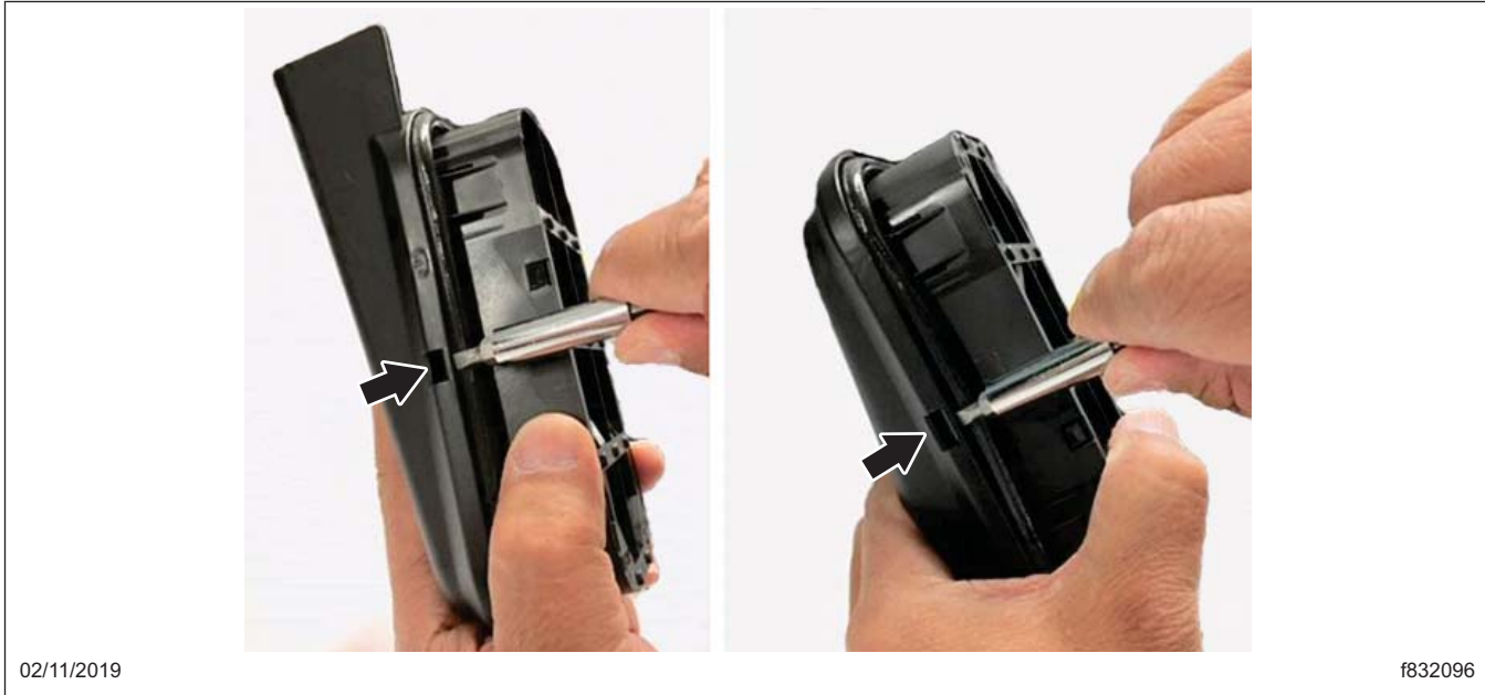
Fig. 4, Engaging the Side Latches

Business Class M2 > Cascadia 108SD/114SD > New Cascadia