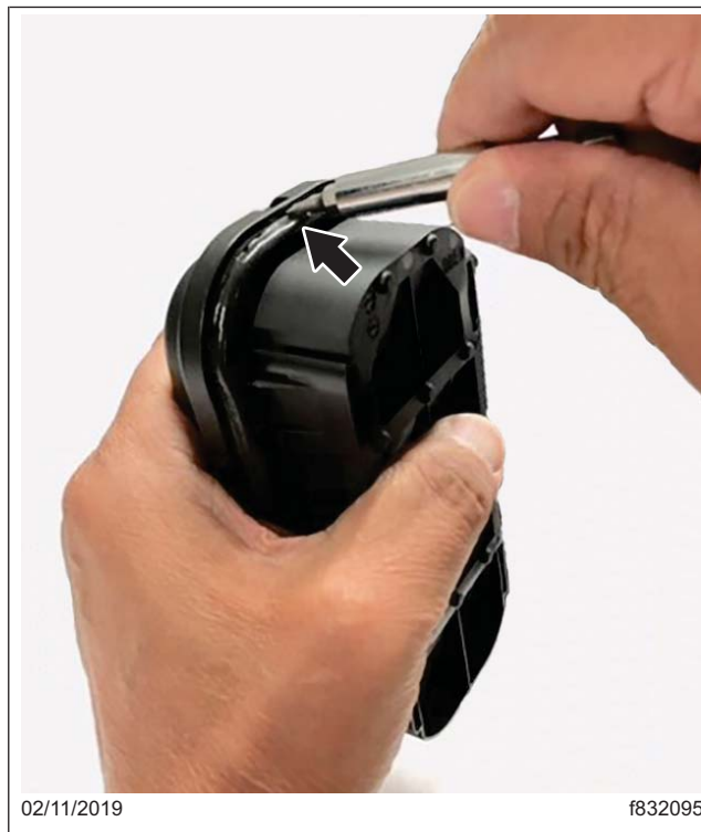
Fig. 3, Engaging the Top Latch