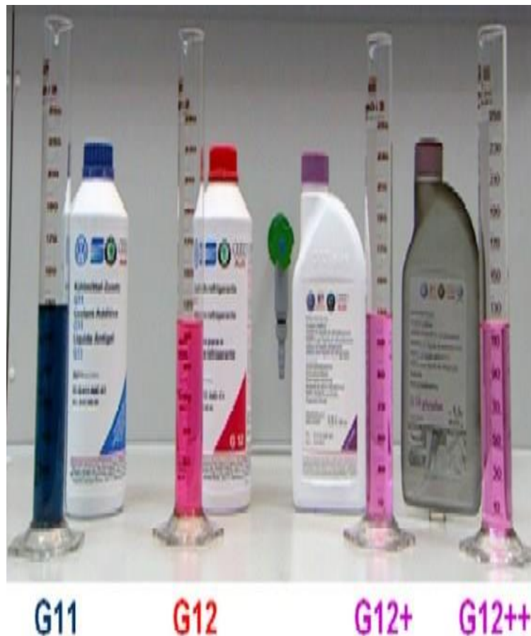
Figure 1. The color of each type of engine coolant. G11 (green-blue), G12 (red), G12+, G12++, G12evo, and G13 (purple).

Tip: Figure 1 is shown for color identification only; coolant packaging may vary.