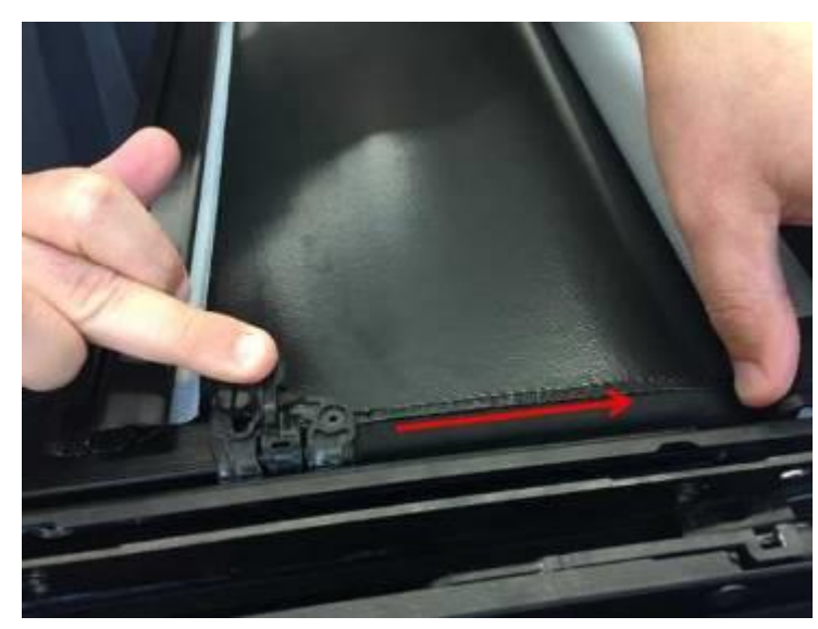
Figure 2. Loosening the roller shade.

Loosen the roller shade from the drive cable and push the material back until the bolts are exposed, then remove the bolts completely (Figure 2 and 3).