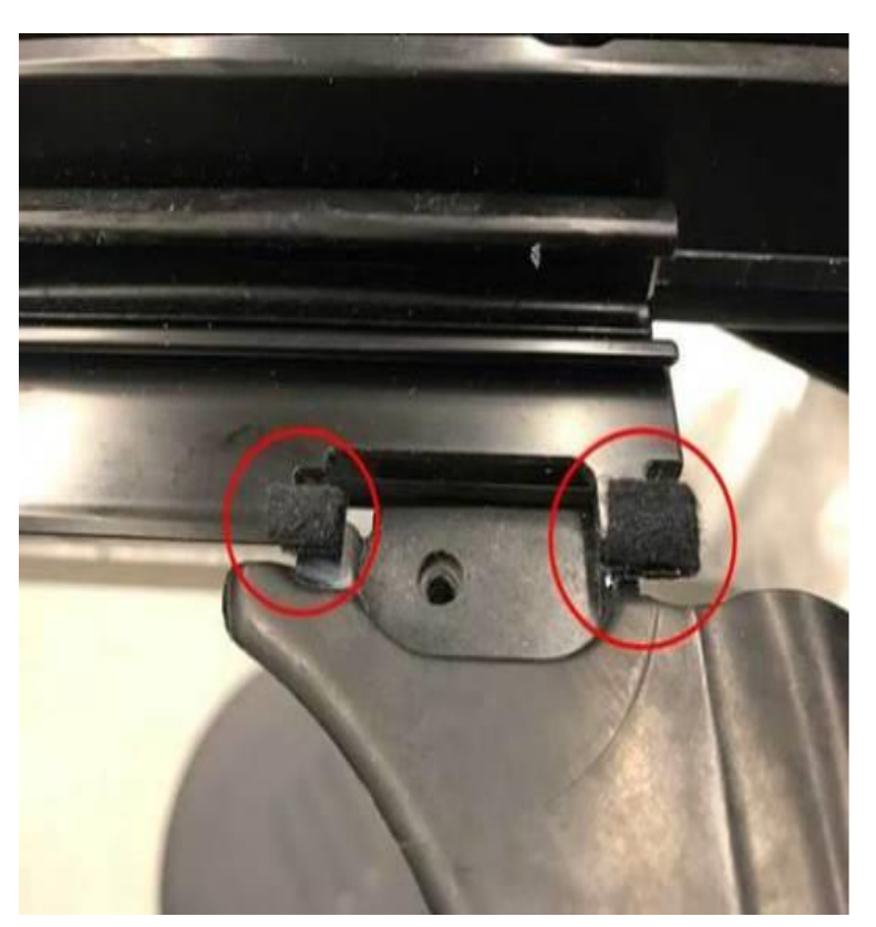
Figure 7. Apply felt tape on points shown.

6. Reinstall the bolts to the roller shade and apply thread locker and torque to 3Nm.