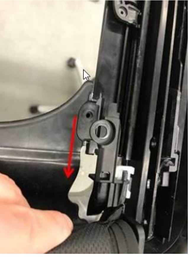
Figure 4. Slide roller shade backward.

Remove the roller shade by sliding it backward and clean the mounting points as shown in Figure 4 and 5. Use the cleaning solution D 009 401 04.