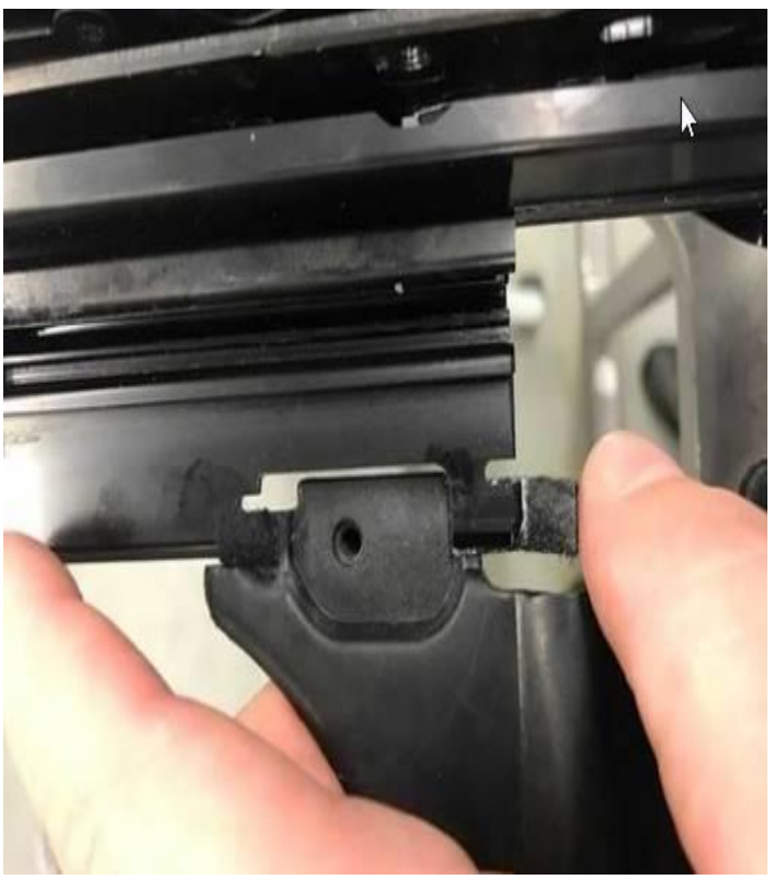
Figure 6. Applying felt tape.

Push down on the roller shade pan and starting from the bottom of the guide rail, apply the 1mm thick felt tape and fold them forward and over to the top of the guide rail (Figure 6 and 7).