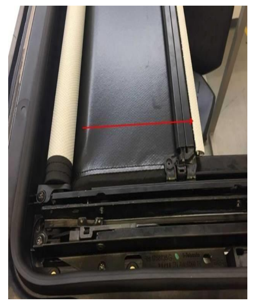
Figure 1. Closing the roller shade.

2. Close the roller shade by about 20cm (Figure 1).