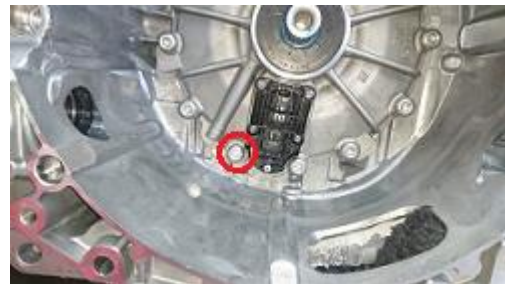
Figure 1. Bolt location.