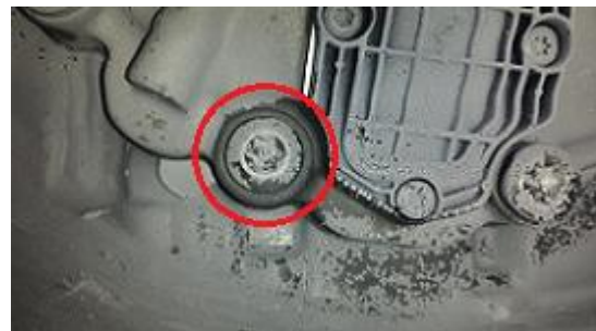
Figure 2. Leak location.