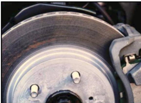
Figure 1. Slight Rust on Rotor (Easy to Remove by Braking)