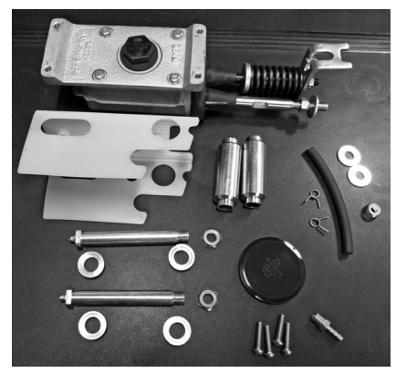
Hose, hose clamps & brass fitting is included only in the "Disc Brake Kit".